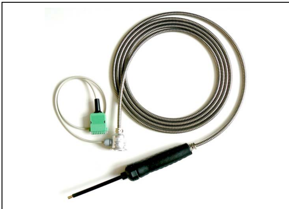
Abb. 2 Sniffer line SL 300

The Sniffer line has an effective length of 4 meters from the KF25 flange to the hand probe.