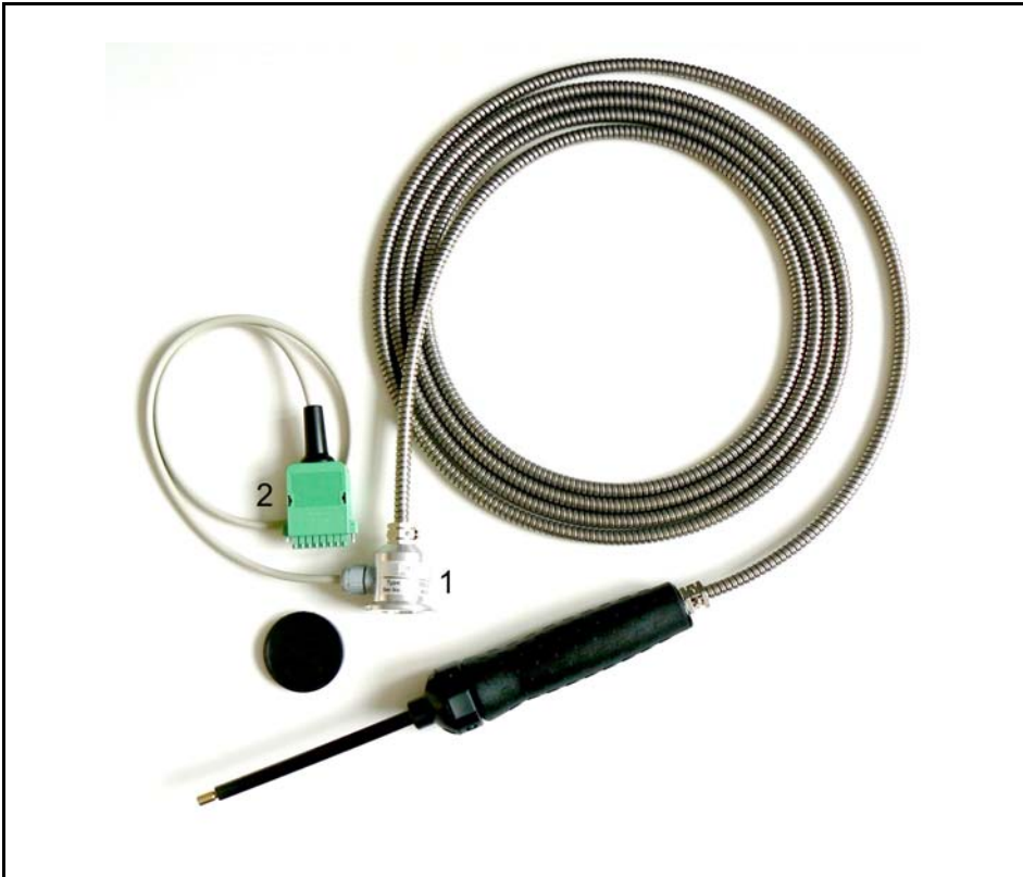
Fig. 3 Sniffer line SL 300 with flange KF25 and 8-pin plug